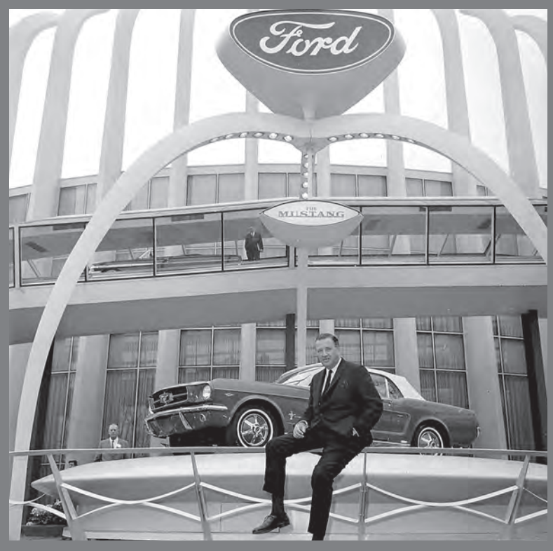
HFII ready to launch the Mustang at the New York World's Fair in 1964.

enry Ford II was heavily involved in ensuring the success of the Mustang. It made its debut before the press at the New York World's Fair on 14 April 1964. When the public arrived at the Fair three days later, they were able to take a ride around the Ford stand in Mustang convertibles. The Magic Skyway was a 12-minute ride designed by Walt Disney, with cars anchored to a chain moving through a series of scenes, from the era of the dinosaurs to a futuristic city. The ride gave the public the chance to get the feel of the new car, and discover all the options and accessories!